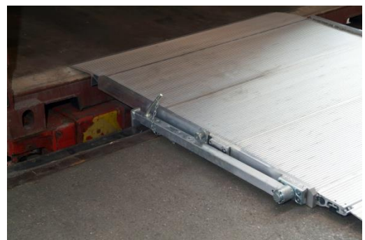
Leveller with safety arms