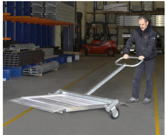
Steel transport trolley