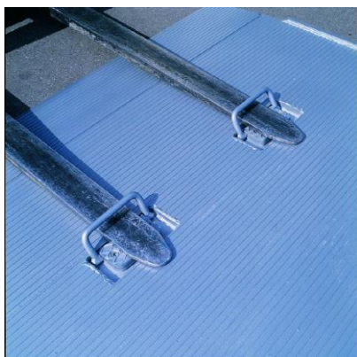
Leveller with retractable fork grips